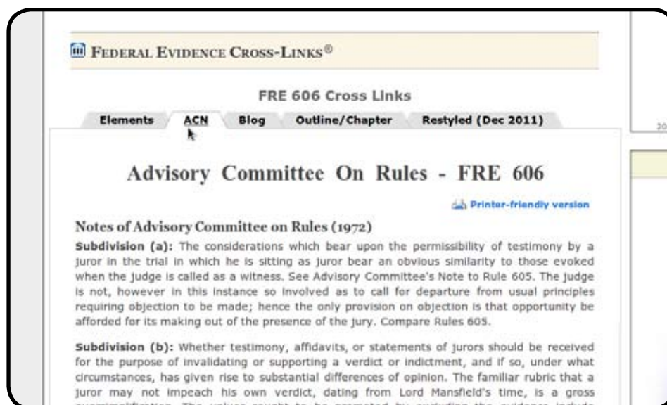
Beta version of Cross-Links® on federalevide.com

Details on the introduction and use of the Rules of Evidence Cross-Link feature will be available at www.FederalEvidence.com in 2012.