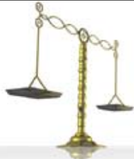
Table of Cases